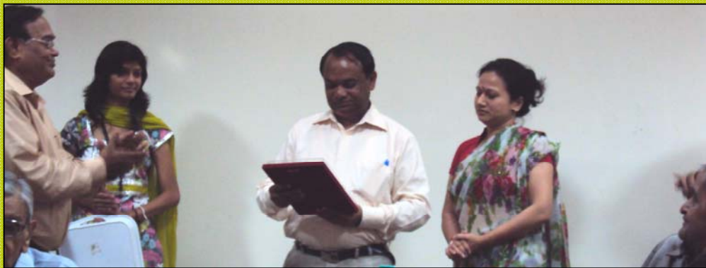
Moments of the 3rd Spandan-IBA Award in Human Values 2009, Greater Noida