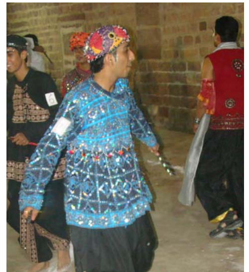
Dandiya Night at AIM Boys' Hostel