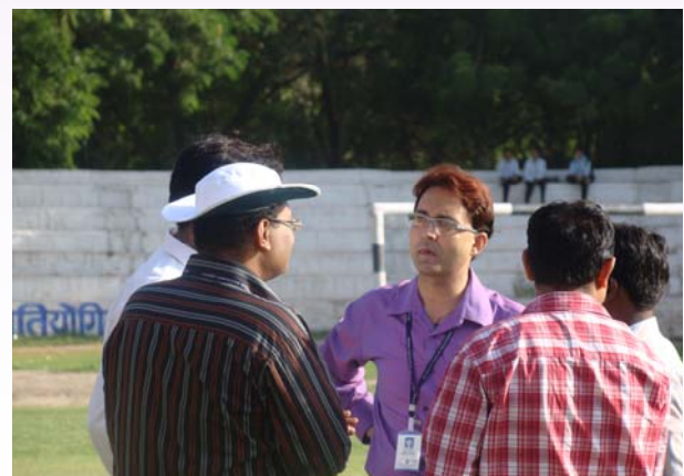
Moments of Sports Day on 15th September 2009